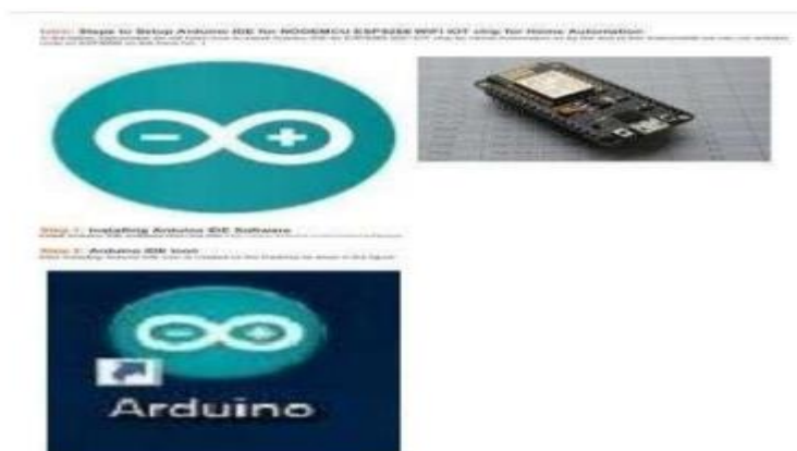
Fig 4.11: Arduino Integrated Development Environment

ARDUINO IDE: The Arduino Integrated Development Environment (IDE) is a cross- platform application (for Windows, macOS, Linux) that is written in functions from C and C++. It is used to write and upload programs to Arduino compatible boards, but also, with the help of third-party cores, other vendor development boards.