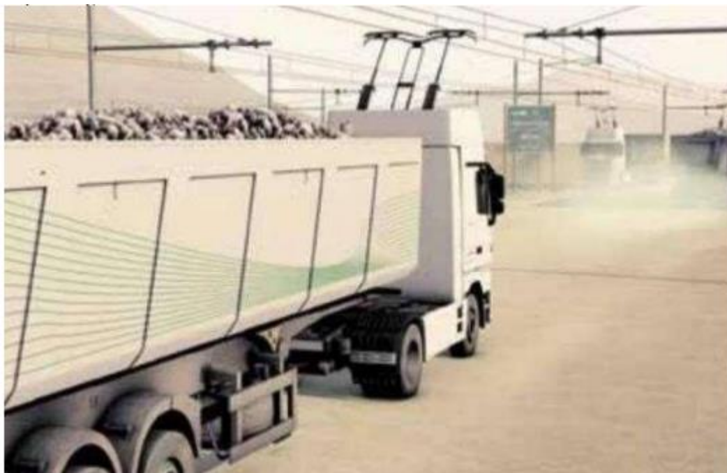
Fig 3.9: Electrified Mine Transport.

Electrified long-haul transport with the design of its infrastructure and the innovative vehicle components, the E-Highway system can make a significant contribution in addressing the difficult challenge of economically decarbonizing long-haul transport as shown in fig. 3.9. In order to achieve the environmental goals and reduce CO 2 emissions, road freight transport requires a fundamental global shift from fossil fuels to alternative drive technologies. Siemens is a leading pioneer in this field, and is providing not only the technical solution for the electrification of freight transport but is also demonstrating a strategic approach achieving a large-scale implementation on highway systems where substantial cost savings