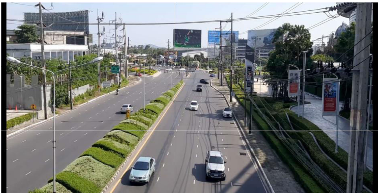
Fig 2: Before Segmentation

The YOLO Algorithm for Traffic Analysis provides comprehensive results like vehicle counting, speed detection, bounding box coordinates and class labels. It accurately detects and counts vehicle in give frame.