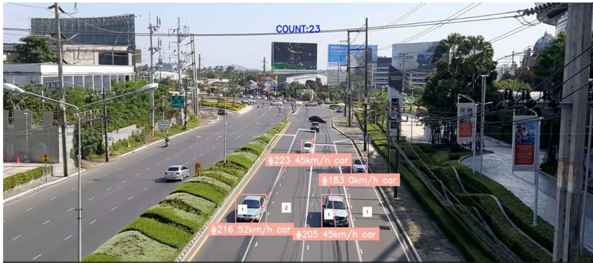
Fig 3: Vehicle count and Speed detection