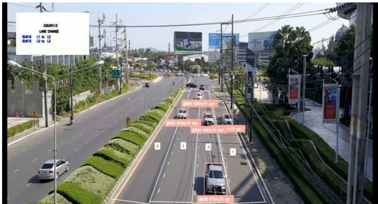
Fig 4: Lane change detection of vehicles on road