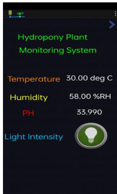
Figure 2 Mobile App

The Hydroponic Plant Monitoring System's user interface efficiently presents critical environmental metrics required for hydroponic plant production. The interface displays 30.00 degrees Celsius for the temperature, 58.00% for the relative humidity, and 33.990 for the pH level—a figure that seems very high and could be the result of a measurement error. Furthermore, there is a symbol of a lighted light bulb that indicates the light intensity, indicating that the plants have sufficient lighting. To improve readability and speed of recognition, each parameter is color-coded: orange for