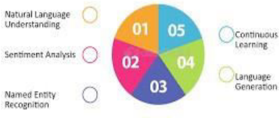
Fig 1: Understanding the Role of Natural Language Processing in AI Generated Reviews

Furthermore, they delve into the advancements in conversational AI, such as the use of transformers, pre-trained language models, and the incorporation of multi-modal understanding for richer customer engagement experiences.