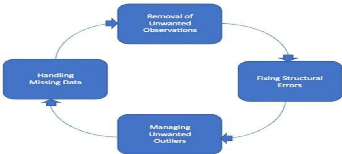
Figure 1. Data cleaning.

Hate speech refers to offensive communication targeting individuals or groups based on attributes like race, religion, ethnicity, gender, sexual orientation, or disability. It manifests in various forms, including verbal abuse, threats, insults, and derogatory language. The impact of hate speech is far-reaching, fostering negativity, harassment, and social division. It can create a hostile online environment, silencing targeted individuals and groups, and ultimately contributing to real-world violence.