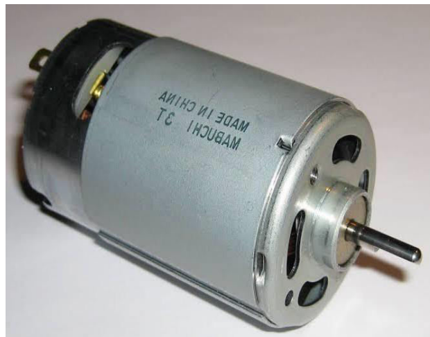
Fig 4.2 DC MOTOR

2. DC MOTOR: - DC motors are commonly used in robotics for their simplicity, reliability, and controllability. They convert electrical energy into mechanical motion, enabling the movement of various parts of the robot such as wheels, arms, or grippers.