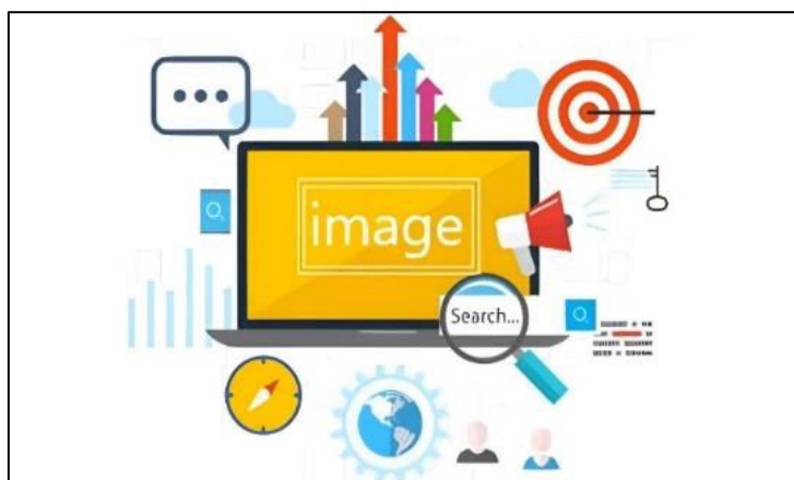
Fig. 2 Image SEO Optimization

Image SEO optimization is important to increase image visibility in search engine results. There are several important steps to optimize your images for search engines. First, it is important to choose the right format for the image such as PNG or JPEG and compress the image to reduce file size and increase load time. In addition, using file names,