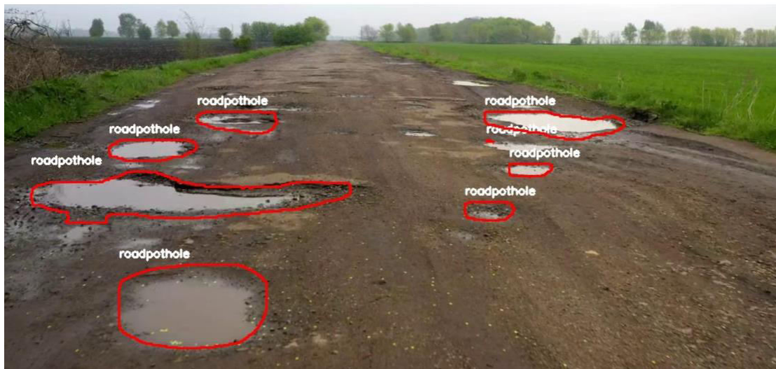
Fig 2. Output image

Figure 2 shows the detected potholes obtained after testing.