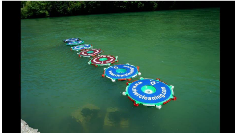
Fig.1 River cleaning system

Another consideration for classification is the scope of the business. Large-scale river cleaning, encompassing vast areas and solving pervasive pollution issues are the goals of macro-level systems. Conversely, micro-level systems are designed for targeted cleaning and monitoring in smaller river segments or specific pollution locations.