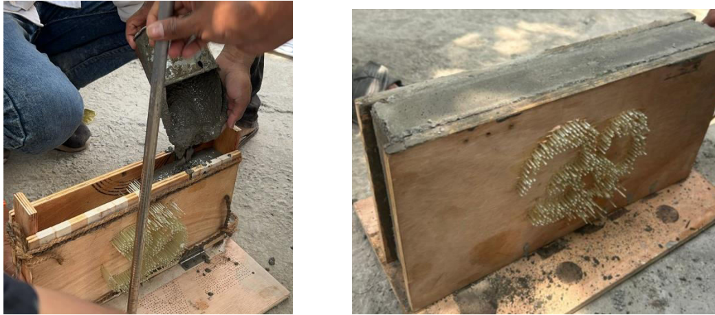
Fig.2 Casting of concrete mold