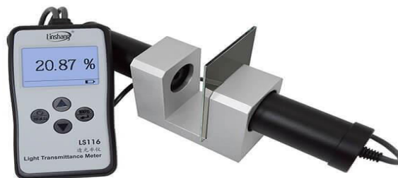
Fig No 1 Light transmission meter