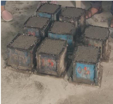
Fig No.2 Casting