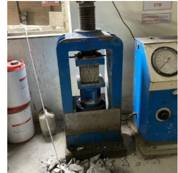
Fig No.4 Testing