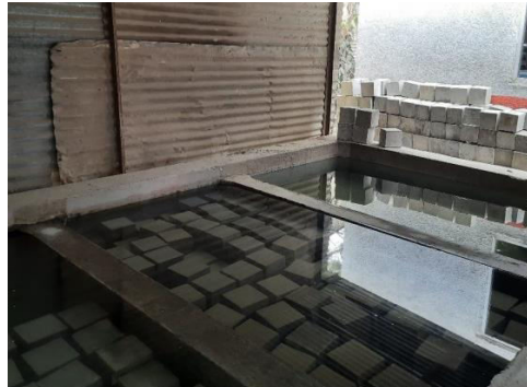
Fig No.3 Curing