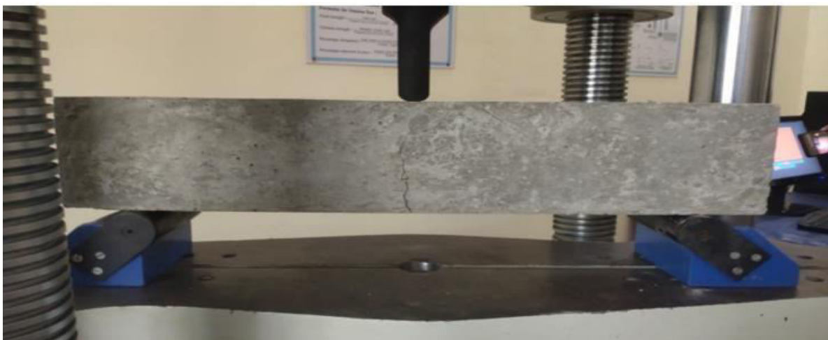
Figure 4.1 Testing Of Normal Column

→ 3 columns are wrapped with single layer configuration. → 3 columns are wrapped with double layer configuration.