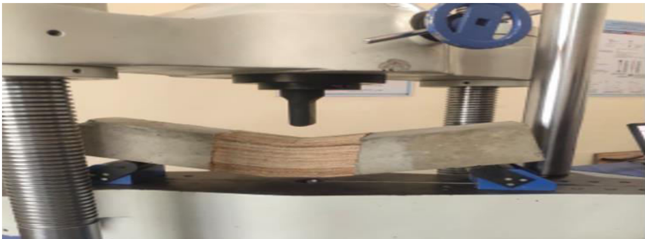
Figure 4.3 TESTING OF DOUBLE LAYER FIBER