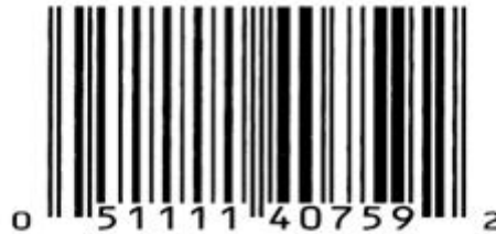
Fig3.1 Barcode