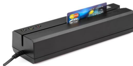
Fig 3.3 Card with magnetic stripe card reader

For the magnetic stripe attendance method, information is encoded on the student card's magnetic stripe. When the card is swiped through the machine, the magnetic stripe data is recorded by the student time clock. This method scans one card at a time and requires direct contact with the reader. Figure 3 shows an image of a card with a magnetic stripe implanted.