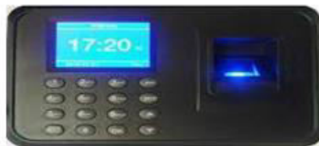
Fig3.2 computerized biometric attendance system

In biometrics, verifiable organic characteristics are studied. Biometrics refers to verification techniques in PC security that rely on measurable real attributes that can be verified as a result. Voice, vein, hand calculation, retina, and so on are some examples of biometric identification schemes. The computer uses one of these biometric identification schemes to determine who you are and grant your exceptional level of access based on your personality. Biometric innovation is used for verification representatives under this method. This method has the unique benefit of being quick and easy to use during the entire cycle. The elimination of the current costs associated with obtaining student cards is one of the additional advantages. The damage, loss, and theft of cards, as well as the continuous need for card support and reclamation, are ongoing costs associated with the other card-using system (attractive stripe and barcode systems).