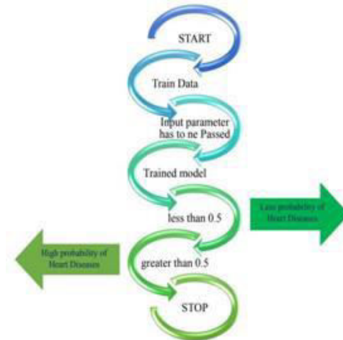
Fig 2 : Software Architecture of final model

Above diagram illustrates the workflow for predicting heart disease using a logistic regression model. The process begins with training the model on a dataset that includes clinical and demographic information. During this training phase, the model learns patterns and relationships between input features, such as cholesterol levels, age, or blood pressure, and the presence or absence of heart disease. Once trained, the model is ready to analyse new data.