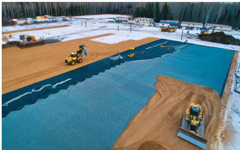
Figure 3: Stretched NPA geocell and gravel infilling in process

The footprint of Pad B under consideration was about 291,000 square feet (27,000 m 2 ). Geotechnical investigation supplied by the owner had recommended 2 psi (15 kPa) as the characteristic undrained shear strength ( S_u ) of the soft silty clay subgrade. The seasonal water table was found to be close to the existing subgrade in the southern side of the pad. The project needed solutions to support a 237-ton (215-tonne) crane and loads from trailers carrying 154-ton (140-tonne) loads, with individual axle loads not exceeding local highway limits.