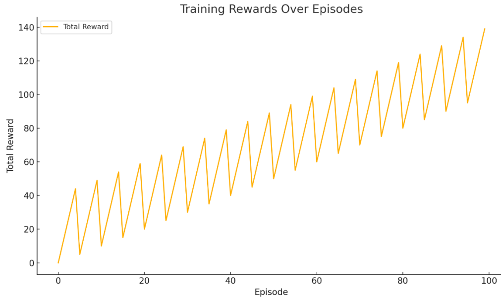
Fig .2"Training Rewards Progression Over Episodes in DQN for Hotel Pricing Simulation"