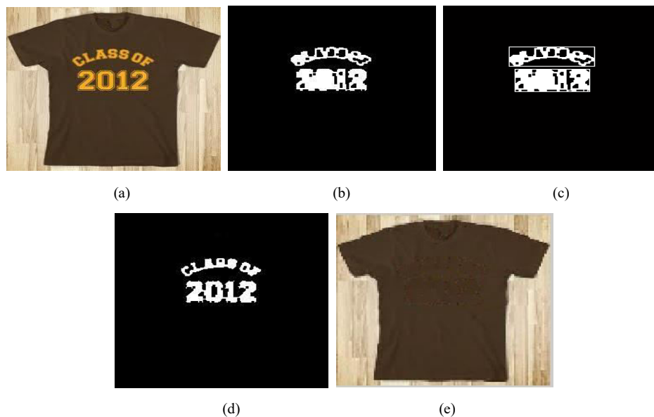
Fig. 3 Text Detection and Inpainting (a) Original image (b) Image after applying first set of criteria (c) Image after applying second set of criteria (d) Image mask (e) Inpainted image using patch size 5 x 5 and search window size 81 x 81

To eliminate small objects, connected component labelling is applied to the resultant image.(c) represents text detection by applying second set of criteria which eliminates all the objects whose area is less than 300 and filled area is less than 500.