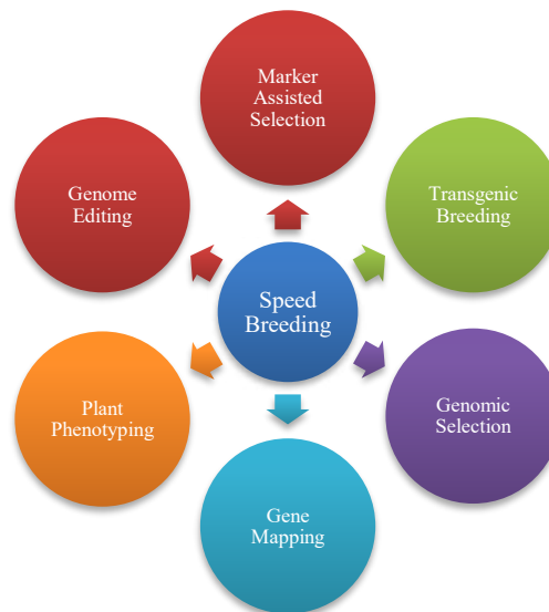
Fig. 3. Relations between speed breeding and other modern breeding techniques

Although conventional plant breeding has been effective in developing outstanding crop types, genetic quality has declined in the modern era as a result of continuous selection and long-term crop domestication, which is one of the limiting factors to crop quality advancement. In this day, genome editing technology has proven to be useful. Gene editing is a process that includes changing a crop species’ genes to increase production. The CRISPR/Cas system expands the potential for genomic variety. It has multiplexing capabilities, which means it can modify the number of target genes at the same time. It solves the real issue, and a high-yielding variety may be generated, but this method takes a long time and demands a lot of work; hence, combining genome editing with speed breeding has the positive future to overcome these problems and 4-6 generations can be produced in a single year (Begna, 2022).