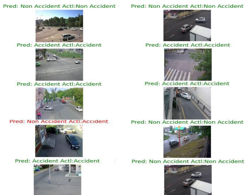
Fig 3: Representative results of accident detection using CNN based DL model