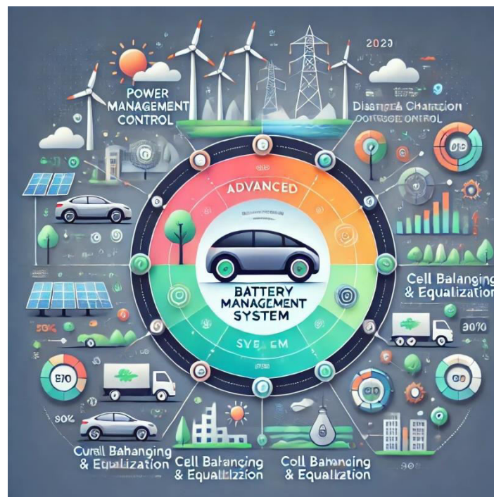
Figure 2. Advanced battery management system

The above figure will delve into the core components of an Advanced BMS and how each function contributes to the safe, efficient, and prolonged operation of the battery system. The key functionalities are as follows: