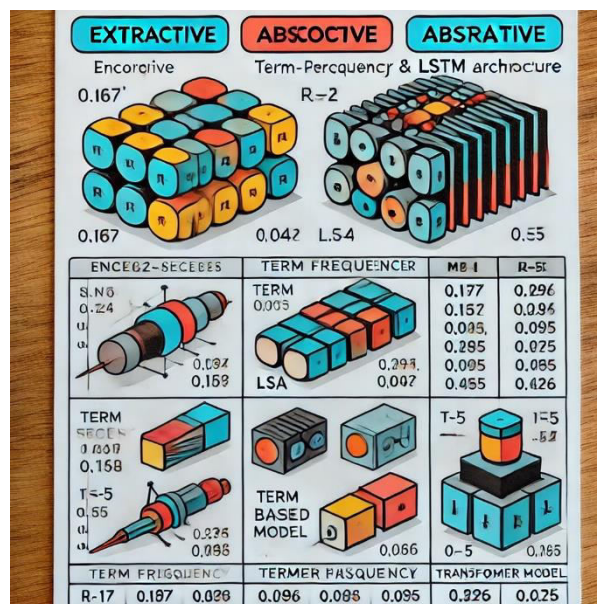
Fig 2. Comparative results

According to the results of our cosine similarity checker, connected papers had an exceptionally high similarity score (up to 0.93), whilst unrelated papers had noticeably lower ratings. This notable difference in similarity scores shows how well the program works to help users find related publications for their literature reviews.