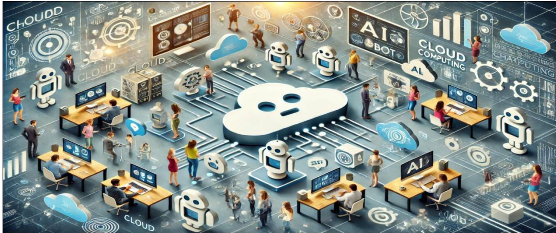
Fig 1.1 Methodology