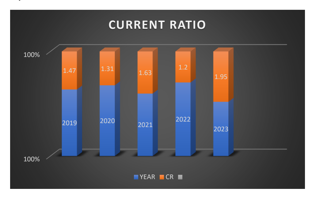
Table 1 shows that the current ratio was 1.47 in the year 2018-19 it was increased to 1.63 in the years 2020-21. In the year 2022-23 the ratio was increased 1.95. It indicates that banks liquidity and its repayment of debts are sound during the period of study.