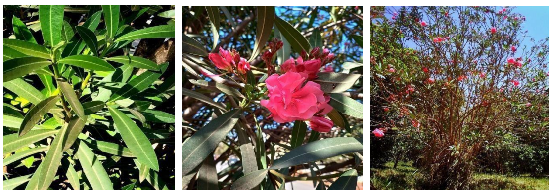
(a) (b) (c) Figure 1: Nerium oleander : (a) Simple, green lanceolate leaves, with entire margins, (b) Pink tubular, lobed, umbel flowers, (c) Oleander plant at a glance growing 3-4 meters tall (Achieng, 2023)

Nerium oleander approximately grows up to 2-4 m tall in height. Its leaves are simple, narrow, linear-lanceolate and dark green [29, 31] . The leaf blades are oblong, truncated at the apex and rounded at the base. The midribs are green in colour. The petioles are either very slender or stouter depending on the cultivars. They grow in pairs or whorls of three (5-18 cm long), have an entire margin and reticulate venation. The young leaves are light green, glossy and mature to a dark green colour. The flowers are pink, tubular, fragrant (very nice scent), umbel, clustered, five-lobed fringed corolla. The flowers are 5 cm in diameter and they grow in clusters at the end of each branch. The fruits comprise of a narrow follicle; 8-16 cm long which ruptures open at maturity to release fluffy downy seeds. Filaments are hairy and seeds have brown feathery tips. Cut or broken branches exude a white sap.