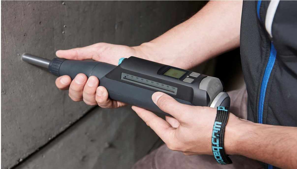
Fig. 1 - Rebound Hammer

The Rebound Hammer test measures the surface hardness of concrete, which is an indirect measure of the compression strength of the concrete. The rebound hammer employs a spring-loaded action for impacting the surface of the concrete and measuring the rebound distance. Information gathered aids in assessing uniformity and integrity of concrete including possible retrofitting requirements. It values quick assessment and portability, allowing effortless use on-site.