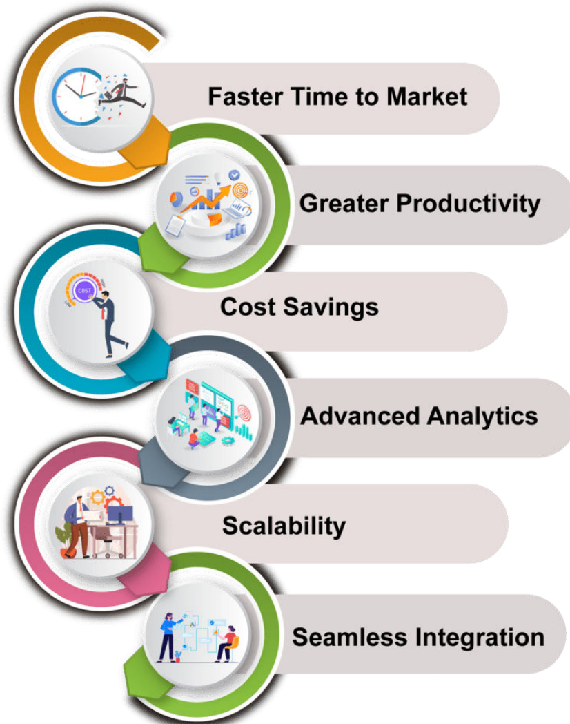
Fig 3: Benefits of Talend