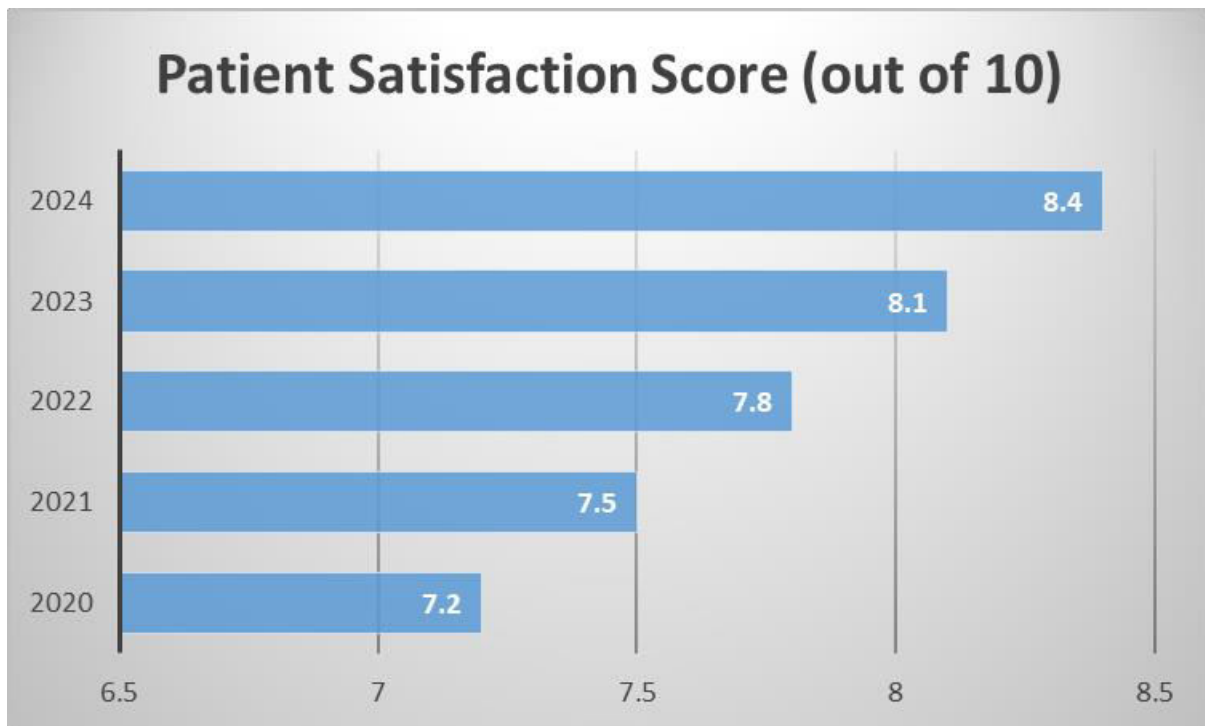
Fig 2: AI Impact on Care Optimization Metrics Over Time [5,6]