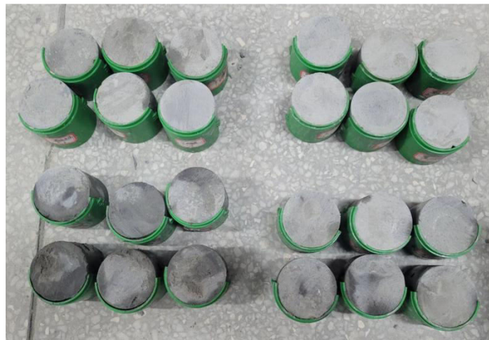
Fig.6 Experimental samples of polished cement

The compressed surface of both ends of the experimental cement samples after 28 days of standard curing will be smoothed with sandpaper, as shown in Fig.6.