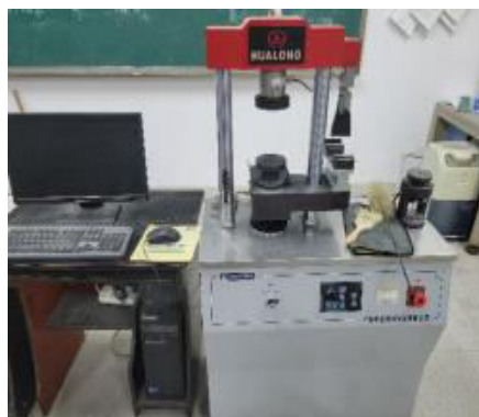
Fig. 4 Microcomputer-controlled pressure tester