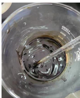
Fig.5 GO dispersion at a concentration of 10 mg/ml

The concentration of the GO dispersion made in this experiment was 10 mg/ml. The steps of making the dispersion were as follows: Graphene oxide and deionised water were put into a beaker at the ratio of 1:100, and then stirred with a glass rod for 1 to 3 minutes, and then sonicated for 10 minutes in a room temperature water bath. The GO dispersion produced was thicker, as shown in Fig.5.