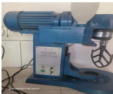
Fig. 1 JJ-5 planetary cement mortar mixer

The main experimental instruments are as follows: cement mixer JJ-5 planetary cement mortar mixer(Fig. 1), electronic balance with a range of 2kg and an accuracy of 0.01g(Fig. 2). Fuyang brand ultrasonic cleaner with a power of 240W(Fig. 3), microcomputer-controlled pressure tester with an accuracy level of 1 and a range of 300KN(Fig. 4), and moulds for cement test blocks.