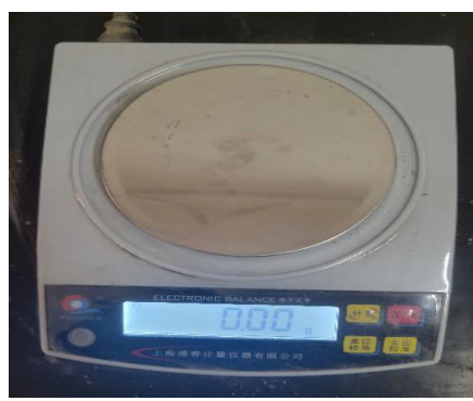
Fig. 2 Electronic balance