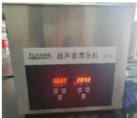
Fig. 3 Ultrasonic cleaner