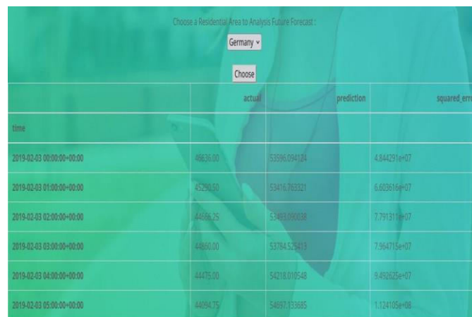
Fig 1 Power Consumption Forecasting Table

The developed power consumption forecasting system integrates machine learning techniques to enhance prediction accuracy and support better energy management decisions. The primary objective of the system is to analyze historical power consumption patterns and predict future electricity demand, ensuring an optimal balance between production and consumption. The results obtained from the model demonstrate its ability to capture seasonality, fluctuations, and anomalies in power consumption data. By leveraging a combination of Support Vector Machines (SVM) and Long Short-Term Memory (LSTM) networks, the system provides accurate forecasts, which are crucial for power grid stability and energy resource planning..