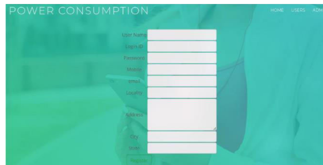
Fig 3: User Registration Interface