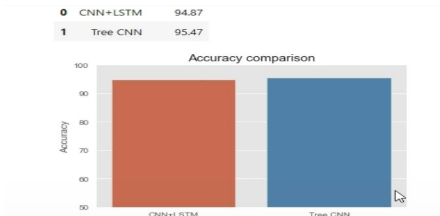
Figure 5.1 Model Accuracy Comparison

This section not only reports the results obtained but also offers a critical discussion of the implications of those results. The strengths and limitations of the deep learning model are examined, along with potential factors that influenced the outcomes. Finally, insights are drawn regarding the broader applicability of the system and directions for future research are proposed.