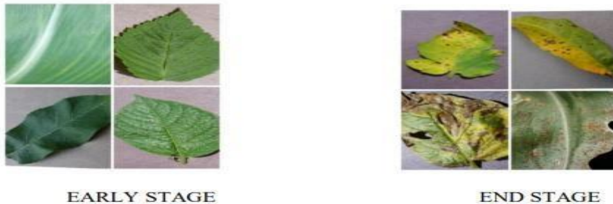
Figure 1: Stages of Leaf