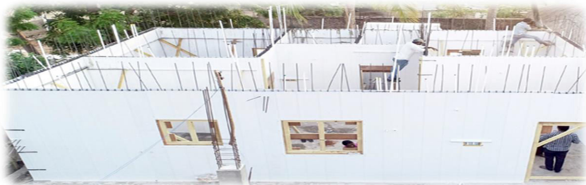
Fig No 4. Stay in Place Formwork

This System is suitable for residential and commercial buildings of any height from low rise to high rise. In order to achieve speedier construction, strength and resource efficiency, the composite structure with Pre-Engineered Steel Structural System as structural members is being used in the present project.