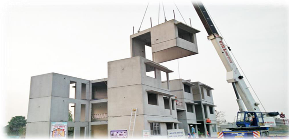
Fig No 1: Precast Concrete Construction System - 3D Precast volumetric

Prefabricated Prefinished Volumetric Construction (PPVC) and concrete modular construction are other names for three-dimensional (3-D) volumetric building. Similar to Lego bricks, rectangular factory-finished modular components are stacked during construction to create an entire structure on-site. Usually, joints are grouted with unique interface elements. The components must be mostly finished with little site work in order to achieve speed and high output. This article examines some of the crucial design techniques and factors that designers should keep in mind while utilizing this kind of building method.