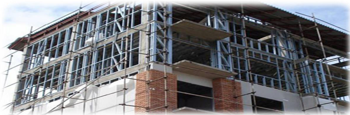
Fig No 2: Light Gauge Steel Structural System & Pre-engineered Steel Structural System

Cold-formed steel is used in the Light Gauge Framing System (LGFS) or Light Gauge Steel Framing (LGSF) building method. It may be used to decks, complete structures, roof systems, floor systems, wall systems, and roof panels. As studs, joists, headers, and truss members, they can also be used as individual framing members. Light steel frame are also capable of acting as both primary and secondary structures. Webbed steel trusses are an illustration of a basic structure made of light steel framing. Since exterior wall finishes depend on the primary structure for support, steel studs serve as secondary structures by offering lateral support.