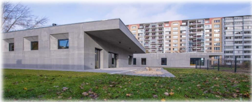
Fig No 5.Lightweight

cost modern construction technique that is non-combustible, has good fire ratings, and provides excellent thermal and sound insulation.