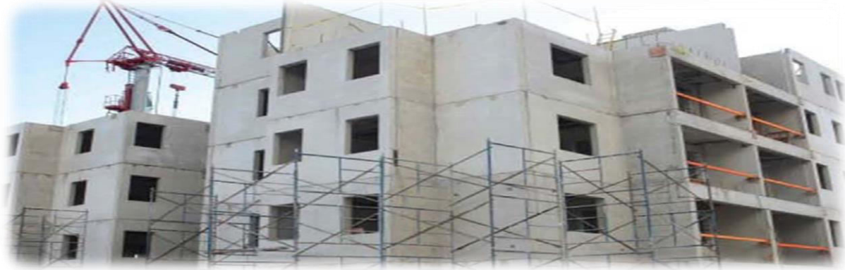
Fig No 3: Prefabricated Sandwich Panel System

from development and destruction. These wastes have a large negative impact on the ecosystem. Prefabricated Sandwich Panel System in India is needed.