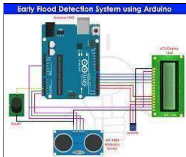
Circuit of Flood Detection System