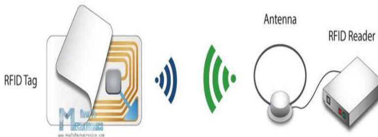
Fig-RFID TAG AND RFID TAG READER

An RFID system consists of two main components, a transponder or a tag which is located on the object that we want to be identified, and a transceiver or a reader. The RFID reader consists of a radio frequency module, a control unit and an antenna coil which generates high frequency electromagnetic field. On the other hand, the tag is usually passive components, which consist of just an antenna and an electronic microchip, so when it gets near the electromagnetic field of the transceiver, due to induction, a voltage is generated in its antenna coil and this voltage serves as power for the microchip.