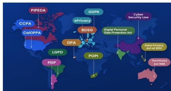
Figure 1: Global Data Protection Laws and Their Impact on Cloud Providers

Brazil's LGPD is similar to the GDPR and applies to companies operating in Brazil or processing the data of Brazilian citizens. It includes provisions for data localization and data subject rights, which affect how data can be stored and transferred.