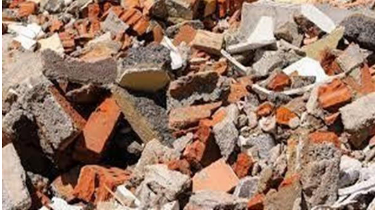
Fig.: Demolition waste

Fine Aggregate: Fine aggregate is one of the crucial components of the concrete. For the present study, the fine aggregate proportion of the concrete constituted by the natural sand.