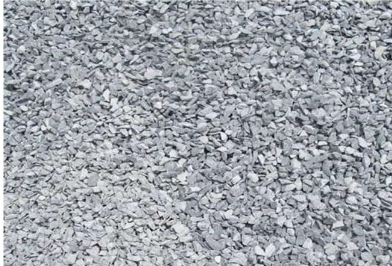
Fig.: Coarse Aggregate