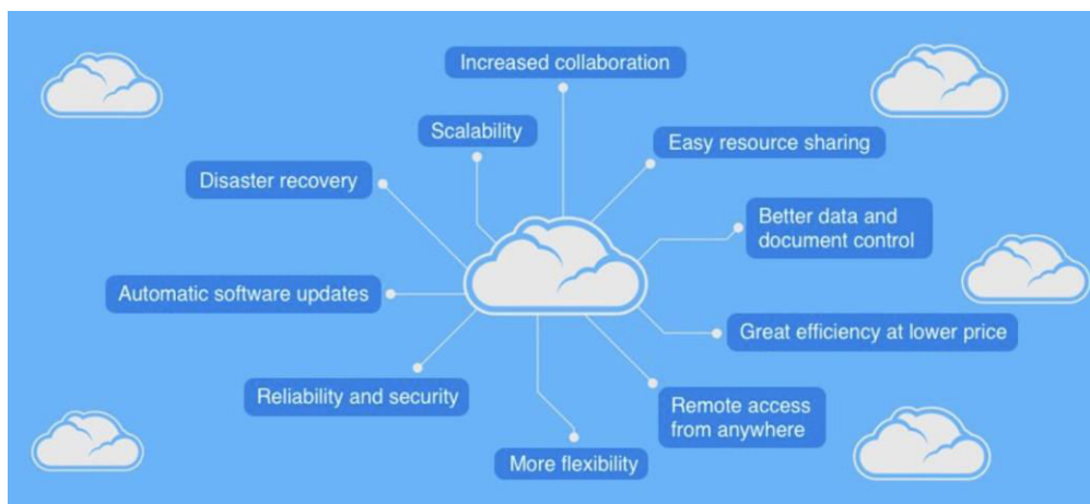
Figure 3: Graph-Based Cost Modeling.

For instance, graph-based models allow firms to make informed decisions about hosting workloads on-premises, in a public cloud, or within a hybrid environment based on cost and performance [3].