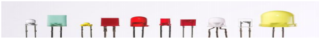
Fig : LED

A light-emitting diode (LED) is a semiconductor light source. LEDs are used as indicator lamps in many devices, and are increasingly used for lighting. When a light-emitting diode is forward biased (switched on), electrons are able to recombine with holes within the device, releasing energy in the form of photons.