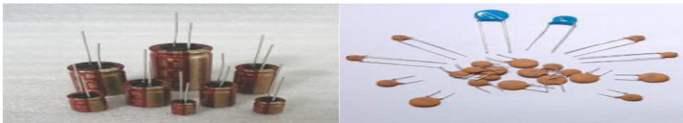
Fig : Capacitors

A capacitor or condenser is a passive electronic component consisting of a pair of conductors separated by a dielectric. When a voltage potential difference exists between the conductors, an electric field is present in the dielectric. This field stores energy and produces a mechanical force between the plates. The effect is greatest between wide, flat, parallel, narrowly separated conductors.