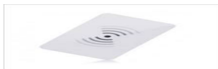
Fig : RFID card

RFID (radio frequency identification) is a form of wireless communication that incorporates the use of electromagnetic or electrostatic coupling in the radio frequency portion of the electromagnetic spectrum to uniquely identify an object, animal or person.