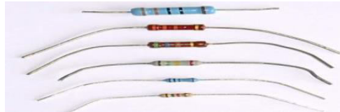
Fig : Resistors

A resistor is a two-terminal electronic component designed to oppose an electric current by producing a voltage drop between its terminals in proportion to the current, that is, in accordance with Ohm's law: