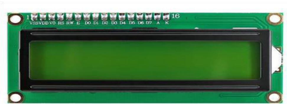
Fig: 3.2 Micro-controller