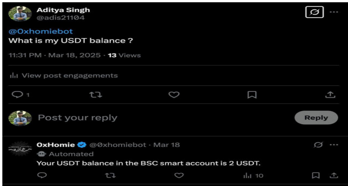
Fig: 4 Fetching balances on X

The diagrams below show the execution of the LLM Agent being able to execute blockchain prompts. Fig 1: This is the example of a user interacting with the agent like getting the balances.