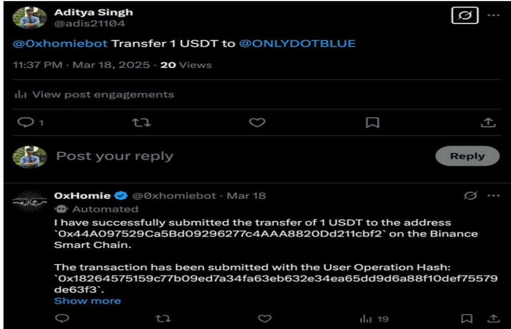
Fig: 3 Executing Transactions on X tagging the usernames