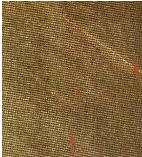
Plate 1- Planar laminated sandstone

Lithofacies are identified based on core description and log shape of the reservoir D7.000 sand in 'Eme' field. Individual lithofacies are composed of different types of sedimentary structures and may be distinguished by the presence of bedding units with a characteristic sedimentary structure, a limited grain size range, a certain bed thickness, perhaps a distinctive texture or colour.