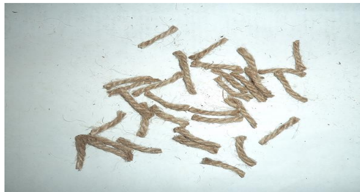
Fig. 2: View of Jute Fiber (D = 2mm, L = 30 mm)