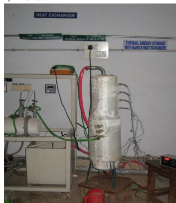
Fig. 2. Experimental set up

An experimental arrangement is illustrated in fig 2 is set up to evaluate the overall heat transfer characteristics of the MHE and for the purpose of heat transfer coefficient measurements in the heat exchanger covering a range of mantle flow rates and thermal boundary conditions. These experiments are carried out at Heat Transfer Laboratory of JNT University, Anantapuram of Andhra Pradesh, India.