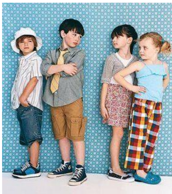
Fig.1. Gender visualization

Child marriage robs girls of their childhood as they step into adult roles that they are unprepared for – be it managing households, bearing children, making decisions and so on. It not only hampers her schooling but also pushes young girls into early pregnancy which harms the health and nutrition of the teenage mother as well as her child.