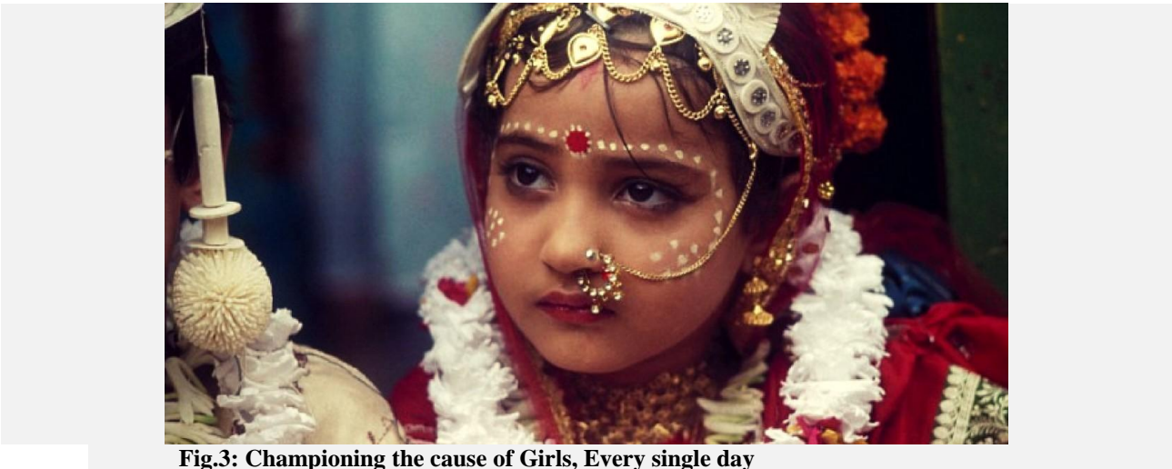
Fig.3: Championing the cause of Girls, Every single day

Gender Studies is an interdisciplinary area which cuts across caste, class faith and location. It is basic to the construction of knowledge and is a critical marker of social transformation. This emerging area incorporates methods and approaches from a wide range of disciplines, yet unifying them through a critical angle of vision. Gender should become an important organizing principle of the national and state curriculum frameworks and their transaction.[9]