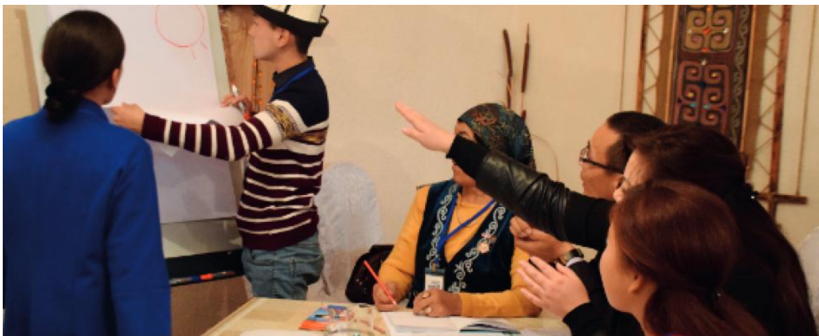
Fig.5: Gender Action Learning Process

Gender at Work has honed a Gender Action-Learning process (GAL) to address women’s rights and gender equality within civil society organisations, international organizations and other development institutions.